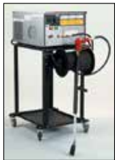
Optional Hose Reel Kit, Cart, Caster Wheel Kit and stainless steel base and cover

Your local Hotsy dealer would be happy to provide an onsite demonstration to determine which pressure washer accessories will help speed cleaning and lower your costs. The most common accessories are telescoping wands, pivot and non-pivot hose reels, flat surface cleaners and high pressure turbo nozzles.