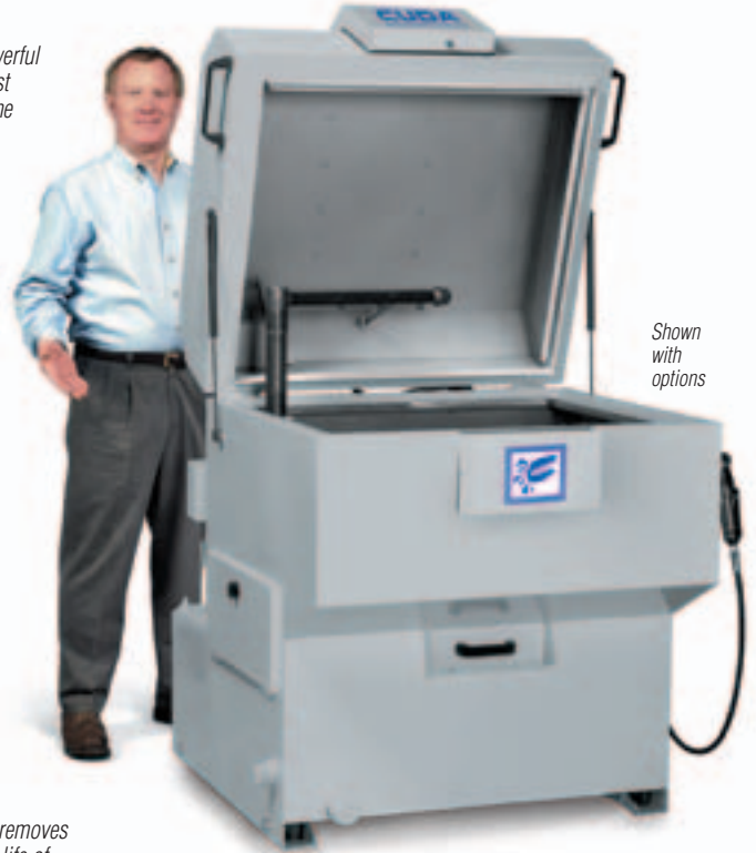
Shown with options

Oil skimmer automatically removes and collects free oils; prolongs life of wash water (standard feature).